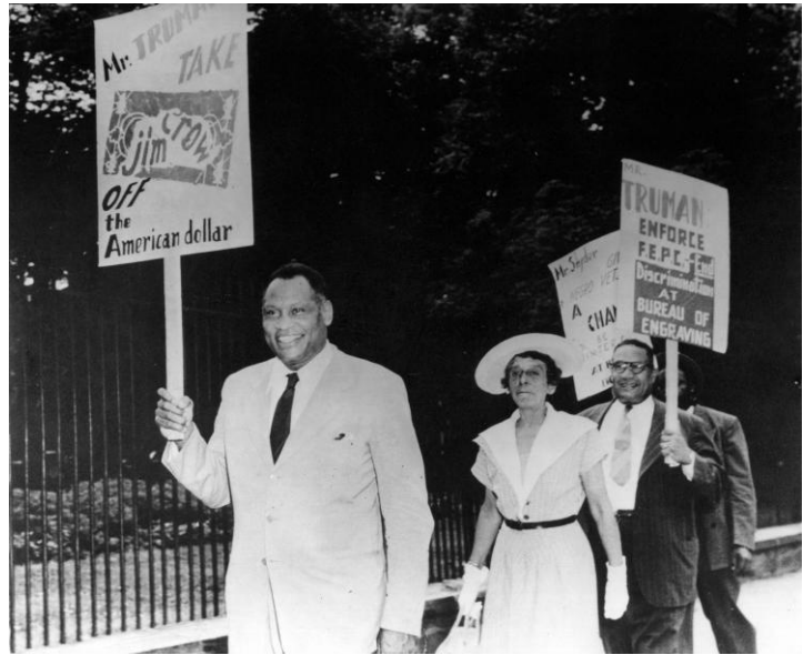
Robeson on an anti-segregation march, 1948