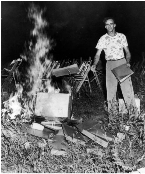
Peekshill Riots, 1949